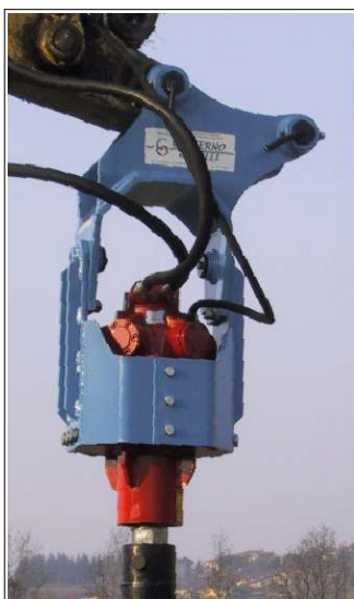
Con Motore a pistoni radiali With radial piston engine