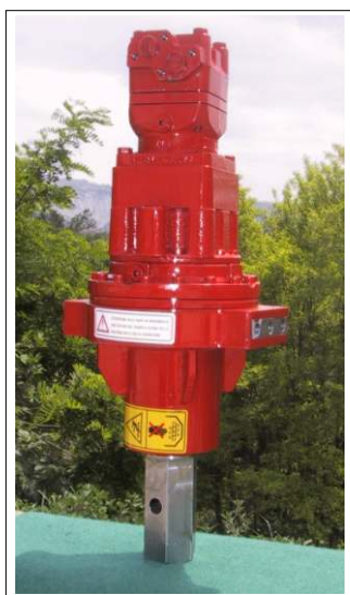
Con Motore orbitale With orbital motor